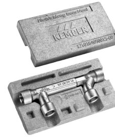
640 50 KHS Floor Box

Fluid-contacting parts made completely of gunmetal For forced flows and continual water exchange in the sanitary block area With Venturi nozzle engineering Minimal pressure differences Soundproofing tested in accordance with DIN EN ISO 3822, Class 1 Pressure stage PN 16 Stagnant-zone-free Insulating shell building material class B1 compliant with DIN 4102