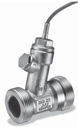
628 0G KHS temperature sensor valve Pt 1000 including resistance thermometer