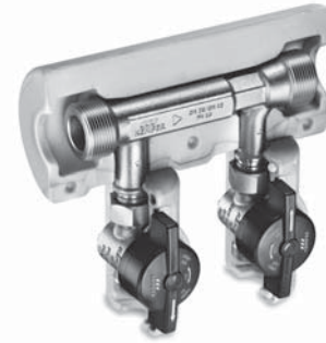
640 02 KHS-Venturi Multi-Circ Distributor Unit for surface mounting with MT / coupling nut